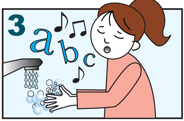
Sing the ABCs.