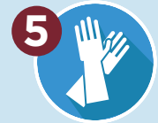
5 Put on Gloves