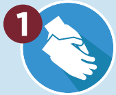
1 Perform Hand Hygiene

Before you begin, tie back long hair and secure in place, remove personal items such as hand and wrist jewelry, gather and inspect PPE carefully. It is important to select the correct size of PPE and ensure that it is in good sanitary and working condition. Damaged or defective PPE should not be used.