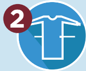
2 Put on Gown