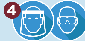
4 Put on Eye Protection