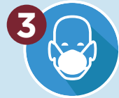
3 Put on N95 Respirator and Perform Seal Check